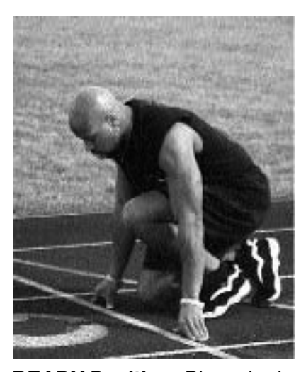
READY Position: Place the lead leg about 4 to 6 inches back from the starting line.

Another trick is to raise the arm opposite from the back leg way up above the hips. The idea is to punch out hard to force you into an explosive start. It should throw you out of your stance. When you explode forward, I concentrate on the first three steps. When you punch out with your arm, your back leg will automatically explode forward. Keep your head down and look where your first steps will be. Those first three steps are all power. These steps perpetuates everything that follows.