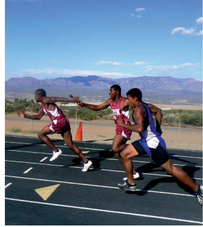
A variety of sports are available to students at Canyon State Academy.