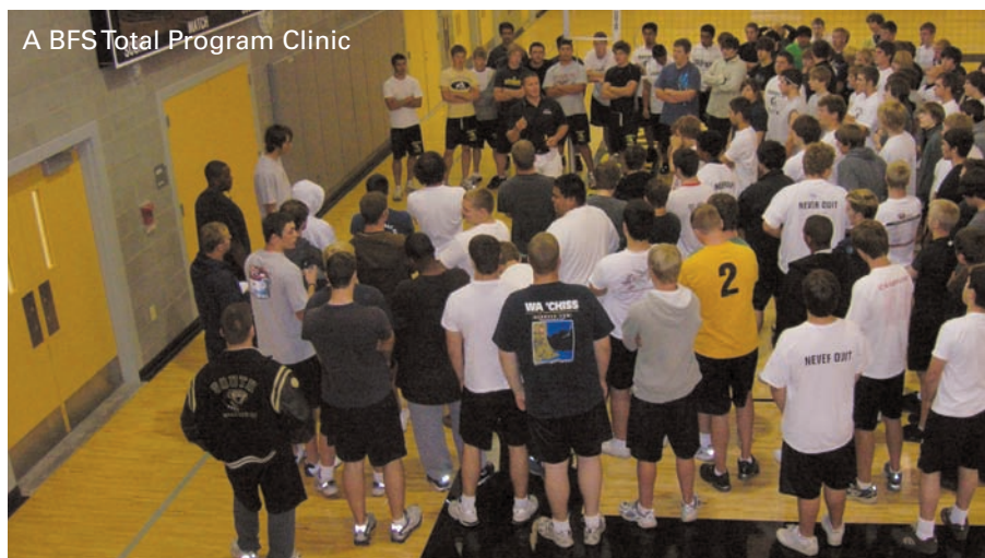
A BFS Total Program Clinic

weight training program as best they could, focusing on the Tuesday and Thursday speed and plyo program. The results were encouraging: the football team managed to improve to a winning record of 6-4, losing in the semifinal games by just seven points. They also had zero injuries.